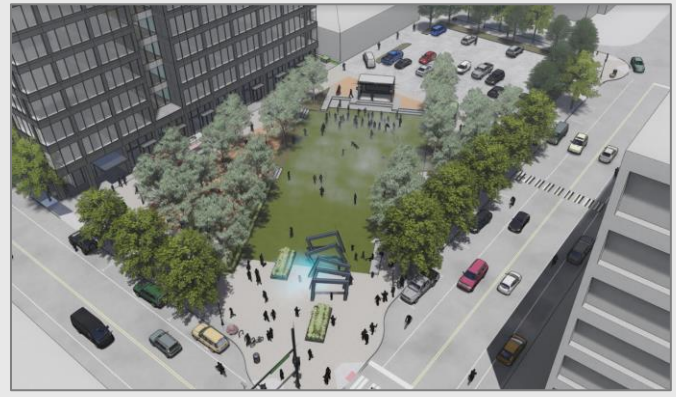
Urban park planned for the corner of 11<sup>th</sup> & Bannock.