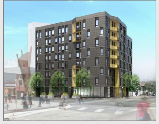
The Vanguard, 75 apartment units + retail, 8 stories

200 W Myrtle St – apartments, garage, retail