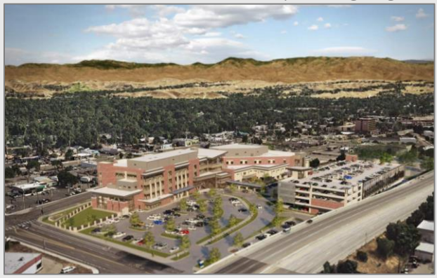
St. Luke's, 230,000sf orthopedic hospital, ~600 space garage