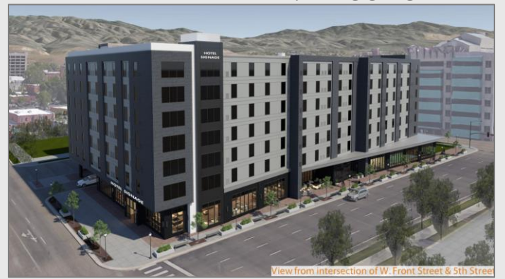
Home 2 Suites, 140 hotel rooms, 600 space parking garage

323 W Broad St – apartments & parking garage