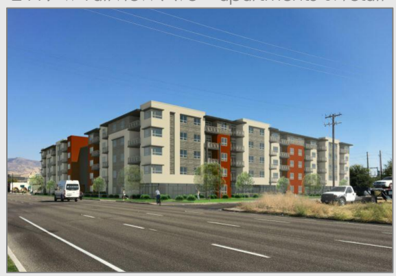
Adare Manor, 130 units, retail

2419 W Fairview Ave – apartments & retail