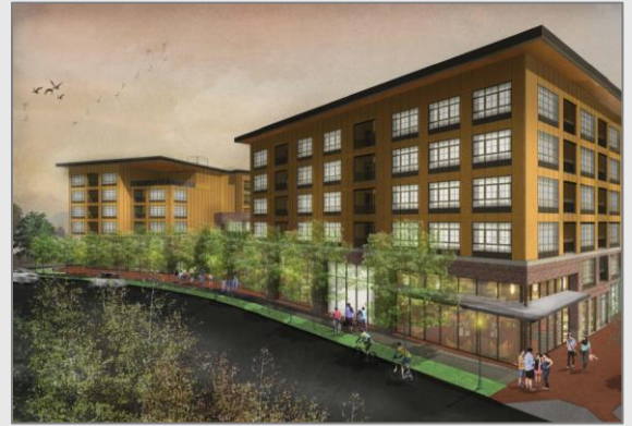
The Afton, 6 stories, 63 units, retail & parking