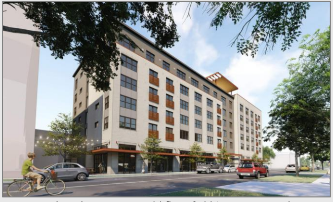
6 stories, restaurant 1st floor & 114 apartment units Photo courtesy of Design Review Submittal & Pivot North

512 W Grove St – restaurant & residential