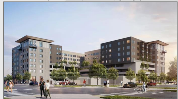
Boise Caddis, 8 stories, 174 apartment units, 413 parking spaces

200 W Myrtle St – apartments, garage, retail