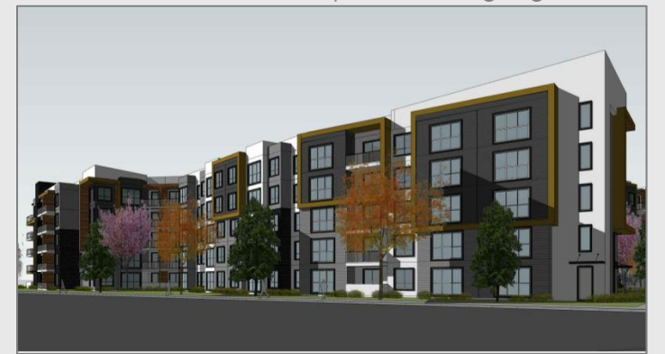
Park Place Apts, 5 stories, 236 units, 356 parking spaces

2419 W Fairview Ave – apartments & retail