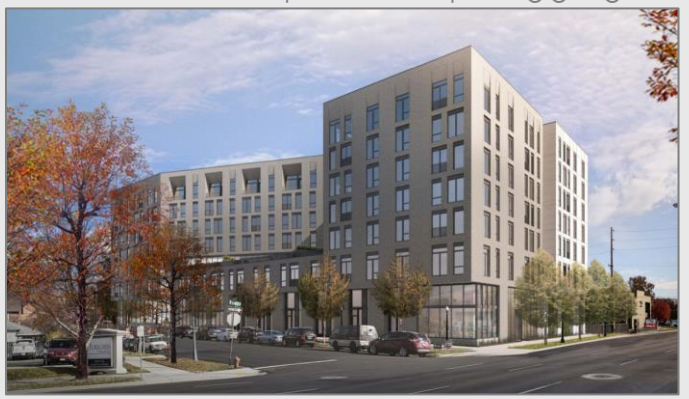
The HEarth, 163 apartment units, 8 stories, 183 parking spaces

323 W Broad St – apartments & parking garage